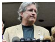
Home Invader Welcomes Sentence