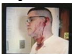
Droid Explodes in Man's Ear