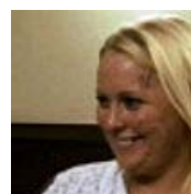
Brides Compete for Plastic Surgery