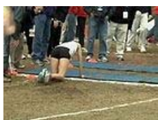
Injured Runner Crawls to Finish to Honor Coach