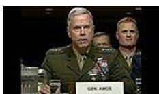
Military brass oppose gay repeal